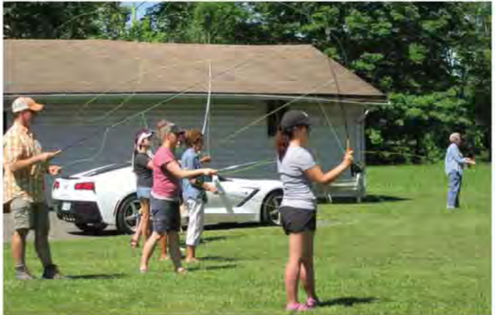
Lines fly at casting practice for the Women's Fly Fishing Seminar.