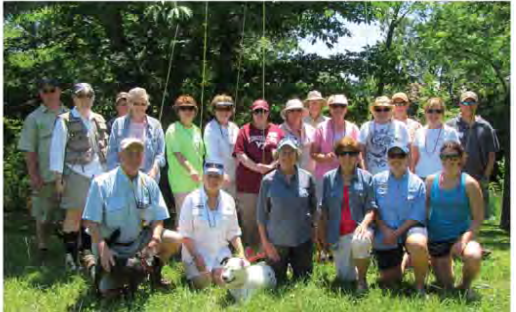
Women's Fly Fishing Seminar participants and instructors gather for group photo.